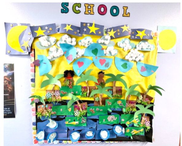
Creation Story Made By BCS Students