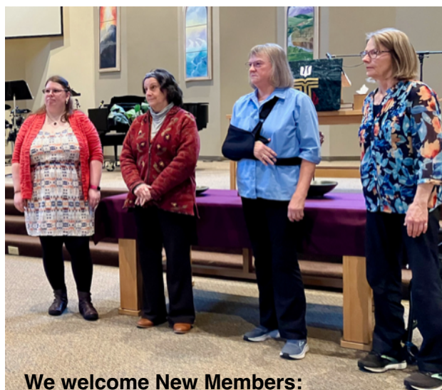
We welcome New Members: