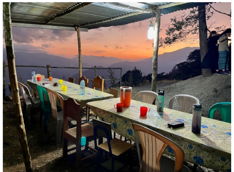
Right: Our view at sunset.