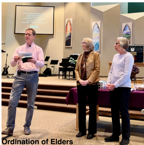
Ordination of Elders