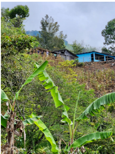
Left: Our camp from below.