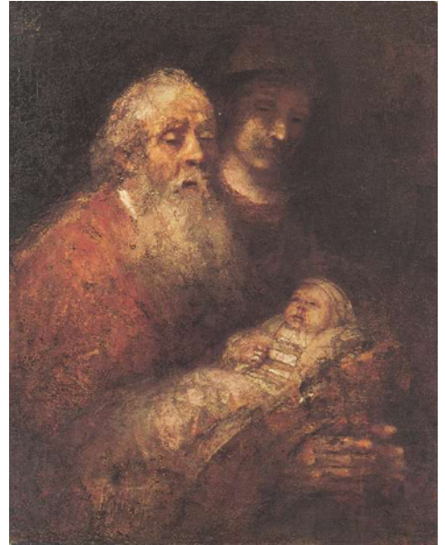
Rembrandt - Simeon Blessing Jesus Public Domain Reproductions