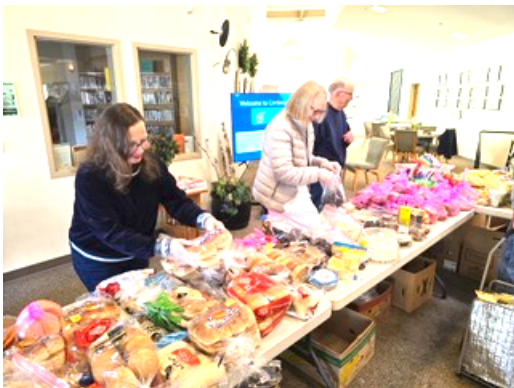
One table of the food for the Miracle Food Network Friday Pantry

In lieu of flowers, please consider a donation to the Bellingham Public Schools Foundation, Cordata Presbyterian Church, or a children's charity of your choice.