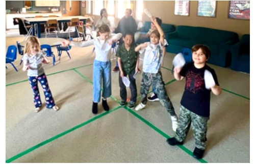
Getting Ready to Celebrate Jesus’ Triumphant Entry into Jerusalem

Sunday Clubhouse Kids recently learned how God established the Israelites in Egypt through Joseph. In May, they will see how over the course of a few hundred years, the Israelites had grown to the point where the Egyptians were feeling threatened. God’s people required a rescuer, and God proved to be the perfect Rescuer and Provider again and again. Over these next few months we will be following the life of Moses and seeing how the Israelites learned to be fully God’s people.