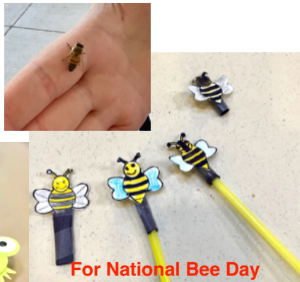
For National Bee Day