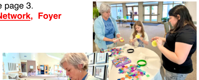
Creating Mother's Day Gifts While Receiving a Trumpet Serenade