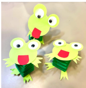
Celebrating Beginning of Spring