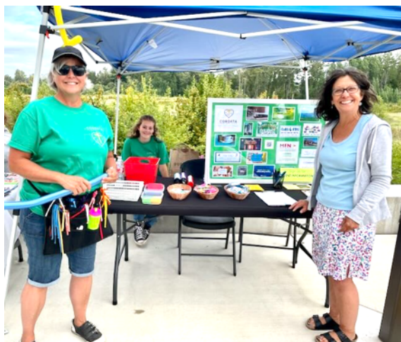
CPC's Booth at Cordata Ice Cream Social

Sundays - 9a, Adult Education Class , Chapel, 10:30a, Worship , Worship Center 10:45a, CPC Kids Clubhouse/Sunday School - See page 3. After Worship, Coffee Fellowship , Foyer Mondays - 2p, Tai Chi Exercise Class , Chapel Tuesdays - 1p, Fun in the Sun , Church Lawn - See page 3. Wednesdays - 9a, Weekly Prayer Group , Zoom - Contact Admin@cordatachurch.org for link. 2p, Tai Chi Exercise Class , Chapel, 5:30p, Youth Group (5th to 8th Grade), 3rd Wednesday Thursdays - 1p, Fun in the Sun , Church Lawn - See page 3. Fridays - 2:30p, Free Groceries - Miracle Food Network, Foyer