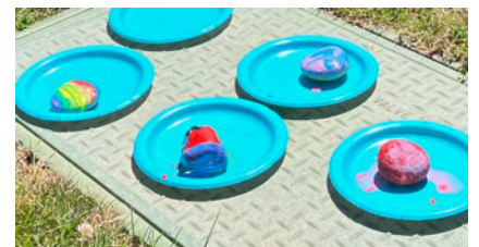
More photos on page 7.