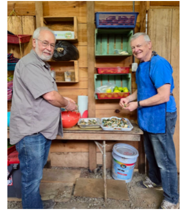
More Guatemala Mission Trip Photos