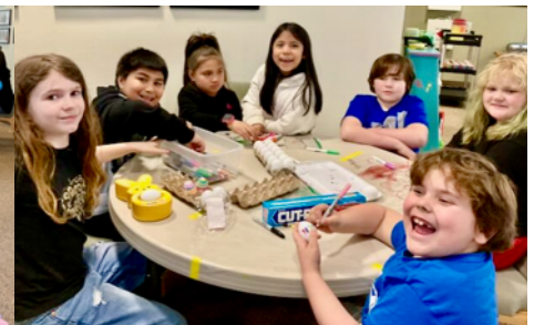
Decorating Eggs at Clubs 4 Kids