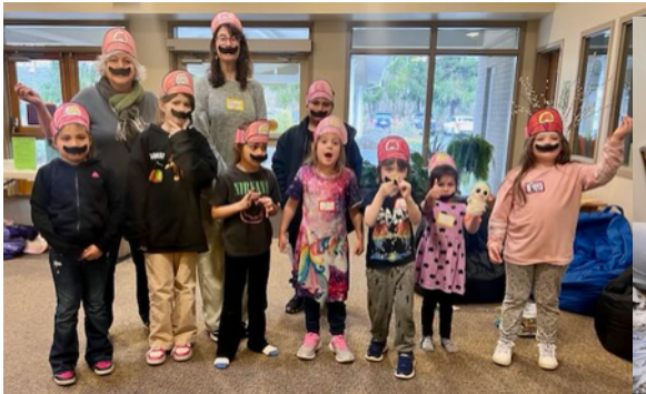
Mario Day at Clubs 4 Kids