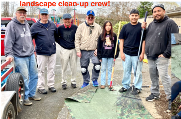
We thank CPC's March landscape clean-up crew!