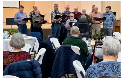
KingsMen of Song serenade Together Tuesday