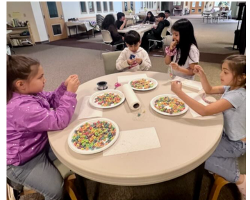
Clubs 4 Kids