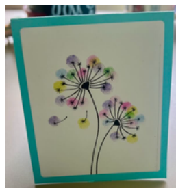
Mother’s Day Craft